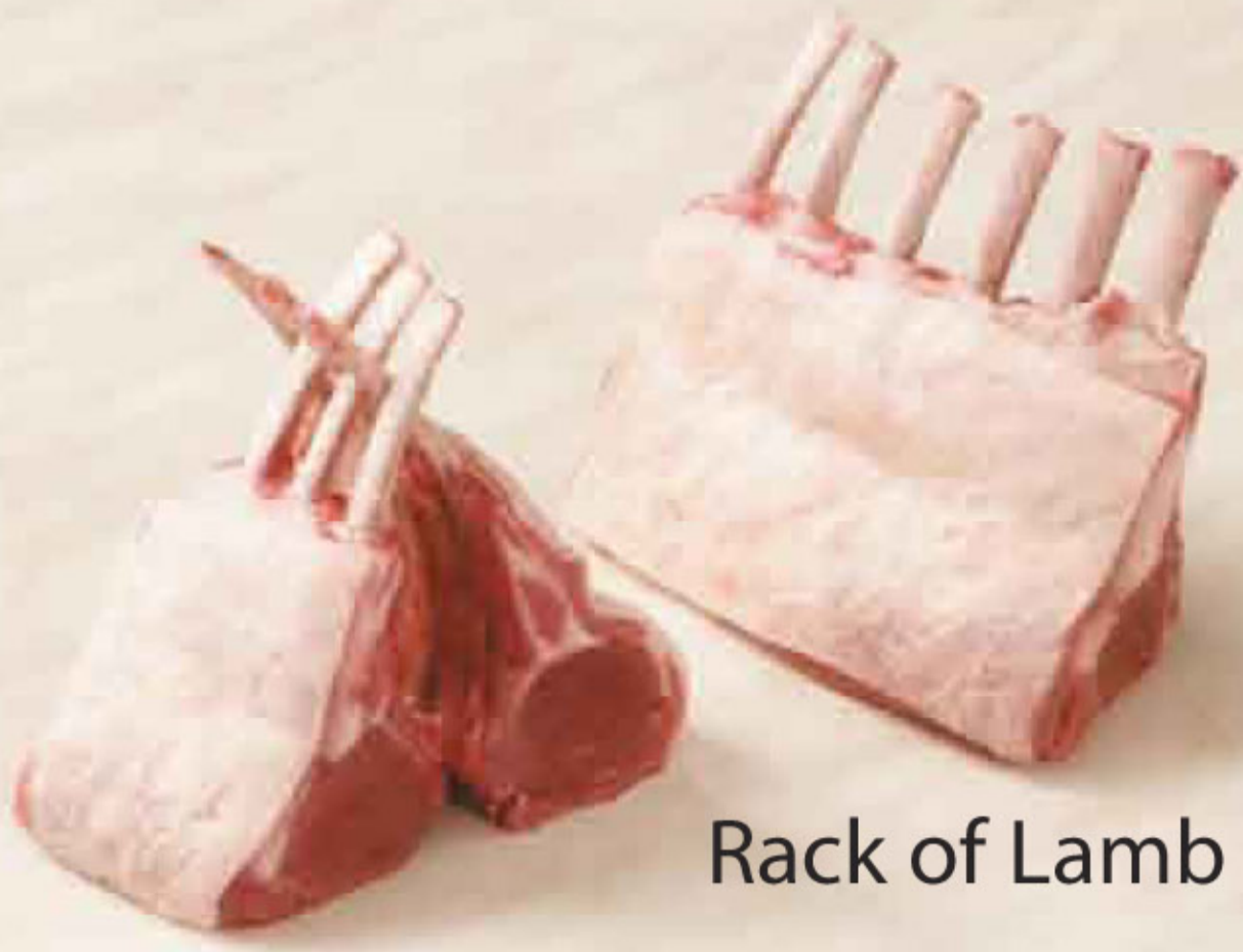
Rack of Lamb