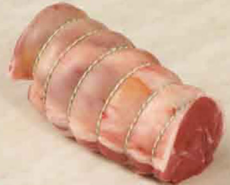
Boneless Leg Joint